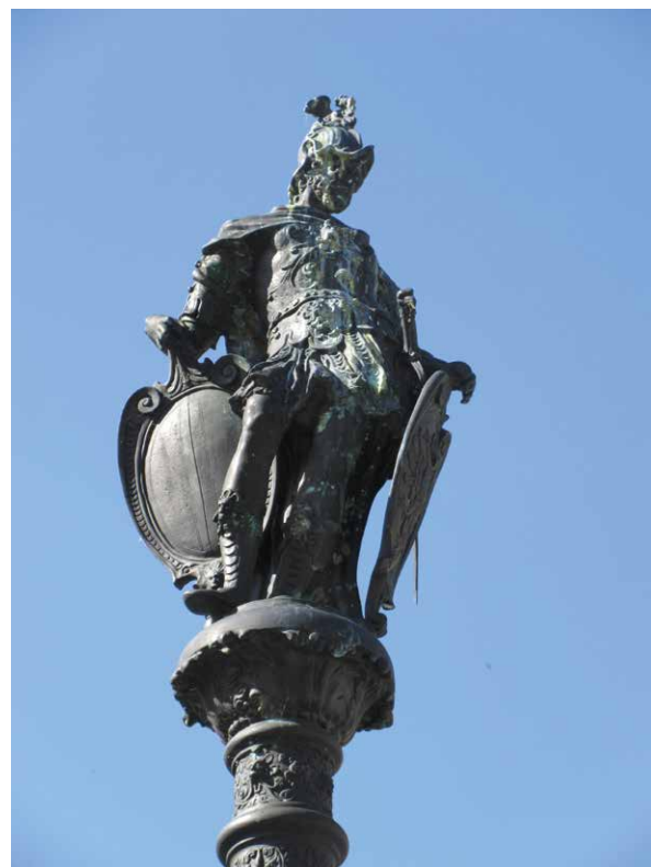
Figure 2. Kempten, fountain in front of the townhall, 1601.

A slightly more monumental elaboration of the same idea, can be found in Kempten. It was known in the 16 th century that the Roman city of Cambodunum had been located here, but where exactly was not yet clear. In reality, it was on the other side of the river (where today is the archaeological park), but in early modern times it was believed that the castle hill next to the city centre had been the ancient Cambodunum (Ott 2002, 266-269). Kempten is also home to the important St. Lorenz Abbey, headed by an abbot who also held the title of imperial prince. The city had been engaged in a dispute with the abbot over its independence from the abbey since the 14 th century. This conflict intensified when the city converted to Protestantism in 1525, while the abbey remained loyal to Catholicism. The abbot's contention was that the city had come into existence only after the abbey was founded in 773 AD. The city council believed it could refute this argument with the city's Roman origins: Kempten was said to be the direct continuation of Roman Cambodunum , and had always been directly under the emperor even long before the arrival of the first abbot. To underline the city's Roman origins, in 1601 a fountain (fig. 2) was built in front of the medieval town hall, with an almost life-size statue of a Roman officer, representing the founders of the city and holding the coats of arms of both the city and the Empire (Weiß & Böck 1993).