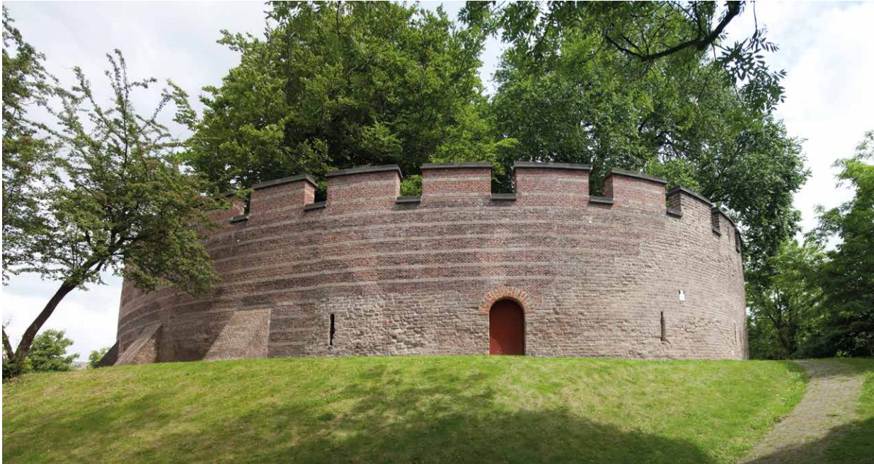
Figure 4. Leiden, the castle hill, in early modern times regarded as castellum Lugdunum (public domain).

to have sprung up along the canal which the Roman general Corbulo had had dug in the 1 st century AD. Thus the central canal of the city, called ‘Oude Delft’ was in fact regarded as part of the fossa Corbulonis . The 17 th -century historian of Delft, Dirck van Bleyswijck, reported that the bottom sections of the tower of the Old Church (Oude Kerk), which stands practically on the quayside of Oude Delft, originated from a Roman watchtower which Corbulo had installed alongside his freshly-dug canal, as was customary along the military limes (Van Bleyswijck 1667, 45). He insisted that this tower was the oldest building in Delft and for many miles around, as was borne out by the tufa blocks used in its foundations. Later, as he had it, the first counts of Holland pronounced sentences at this tower, thereby gradually giving rise to the settlement from the 11 th century onwards.