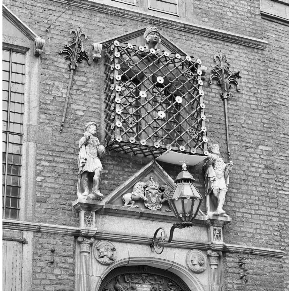
Figure 5. Nijmegen, Townhall (1555), entrance gate with Julius Caesar (right) and Charlemagne (left), post-1945 copies.

Noviomagus , and the large military camp on the Hunerberg and the command post on the Kops Plateau (Willems & Van Enckevort 2009). From the late 15 th century onwards, however, scholars in Nijmegen proposed that the Valkhof castle had been the centre of the Roman city, which in later centuries also Charlemagne had used as his palace. Indeed the Valkhof was located on the site of the last Roman defences from the late antiquity and indeed Charlemagne also had a residence here. But the ancient stronghold was subsequently destroyed and rebuilt by Emperor Barbarossa around 1155. The octagonal St. Nicholas Chapel on the castle grounds dated from the 11 th century, with later repairs. Both because of its octagonal shape and because of the many ancient spolia used as building material in the walls, it was believed that this building must have been a former Roman temple. Moreover, a Roman tombstone of a certain Caius Julius Pudens and his son, reused at the entrance to the chapel, led some to believe it had been a temple in honour of the gods of the underworld, or otherwise the mausoleum of this Pudens (Ottenheym 2021, 372-378).