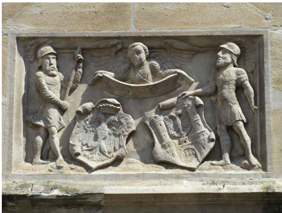
Figure 1. Weissenburg, townhall, memorial stone in the archive tower, 1567 (author).

armour presenting the city coat of arms and the imperial coat of arms with the double-headed eagle (fig.1). The connection of city and emperor is thus literally supported by the Roman past.