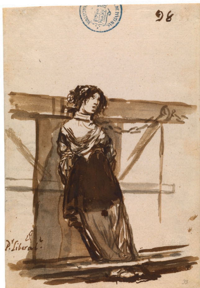
Fig. 3. Por liberal? , 1814–1823, by Francisco de Goya y Lucientes, showing a lady trapped in a horizontal type of stocks.

crimes. By examining pollen collected from a crime scene or person involved, it is possible to be specific about where a person or object has been.