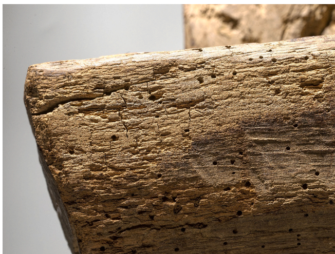
Fig. 2. The underside of one of the cross-braces, which is worn and shows traces of fungal and wood worm attack.