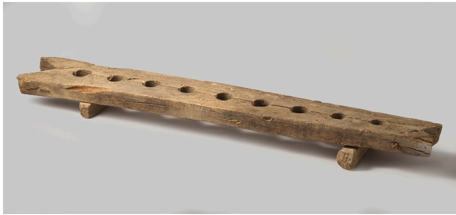
Fig. 1. Oak stocks in the collection of the Rijksmuseum in Amsterdam (Inv.nr. NG.2019–502). Measurements: 265 × 37.5 × 23 cm.