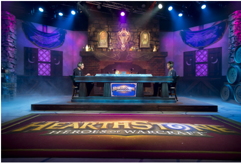
Figure 1: Snapshot of a game in the 2016 Hearthstone world championship[20]. Players are seated facing each other, allowing eye contact.

is a non-invasive affective input channel, as it can be achieved with inexpensive commercial hardware and open-source software such as OpenFace [2]. Facial expression analysis and video games have been combined in multiple studies discussing various topics, such as affective gaming [22, 27], game personalisation [7], player affect evaluation [24, 28] and alternative gameplay mechanisms [25]. Recently, Doyran et al. [9] published a rich dataset that enables multi-modal, multi-player affect and interaction analysis through capturing the facial expressions of board game players.